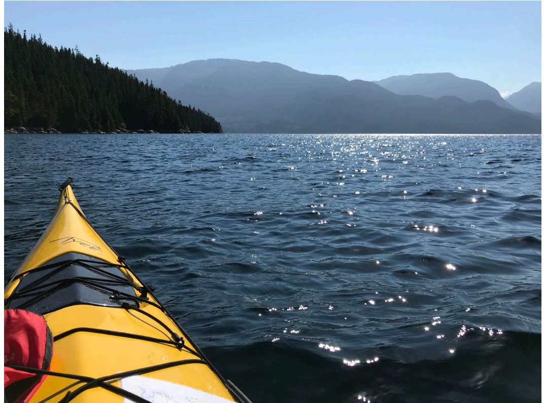
Douglas Channel, July 2018