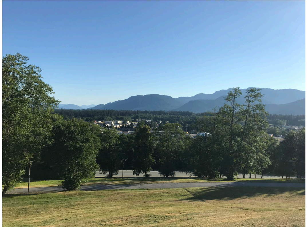
Kitimat, July 2018