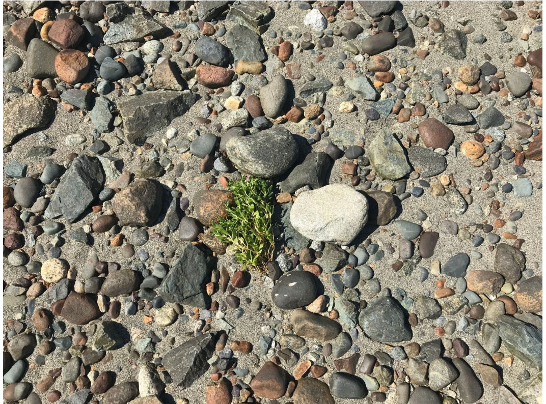
Hospital Beach, July 2018