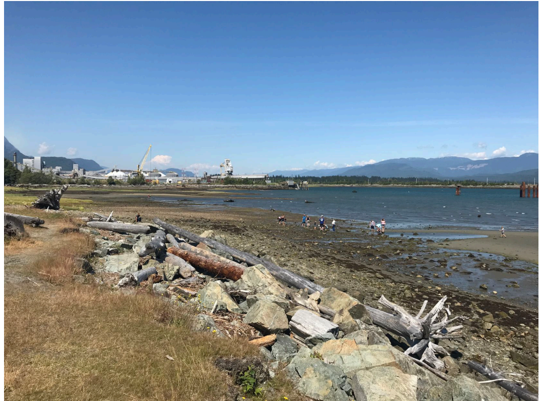
Hospital Beach, July 2018