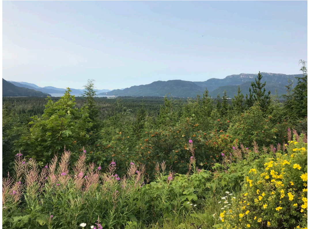
Kitimat, July 2018